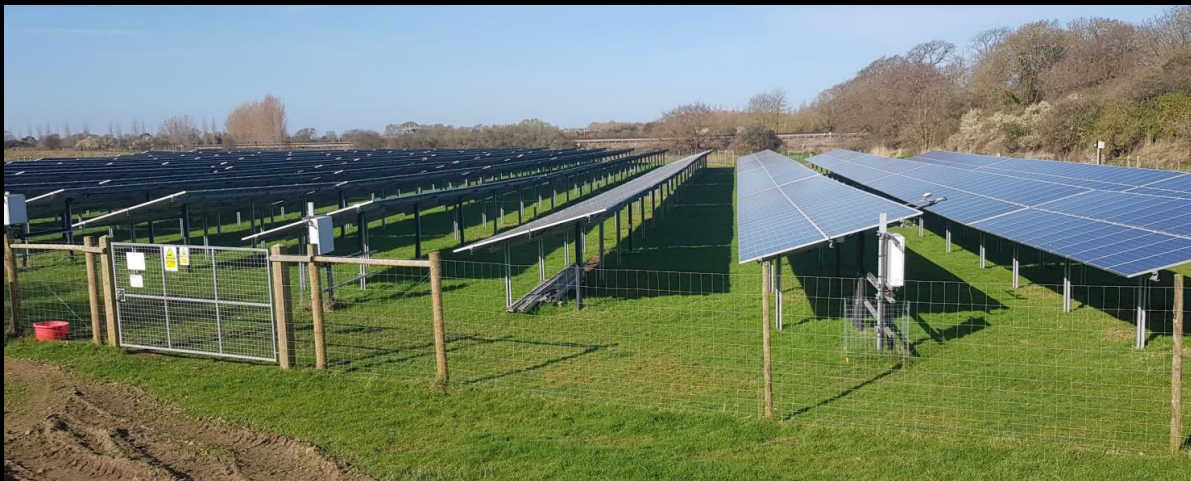
Modules mounted, finished array