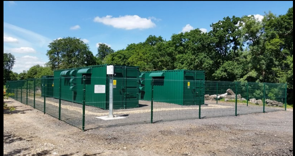
Example of central invertor