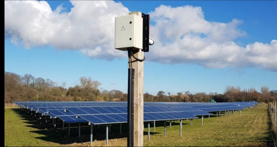
Typical wooden CCTV pole, covering perimeter fence line