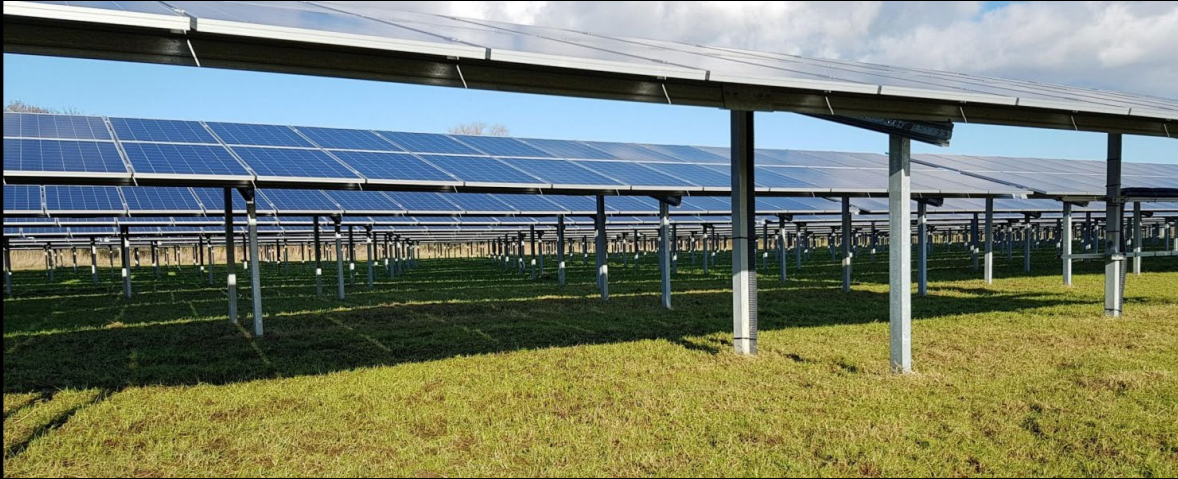
Framework on a mature, grazed solar park