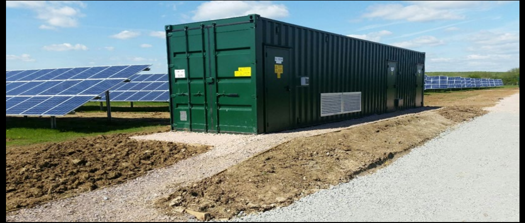
Example of substation