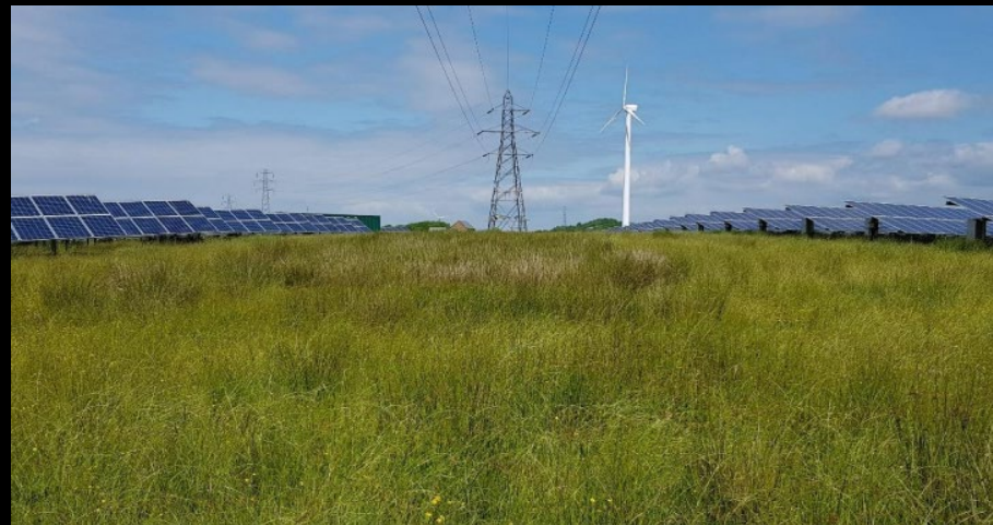
Wild grass under 132kV power lines