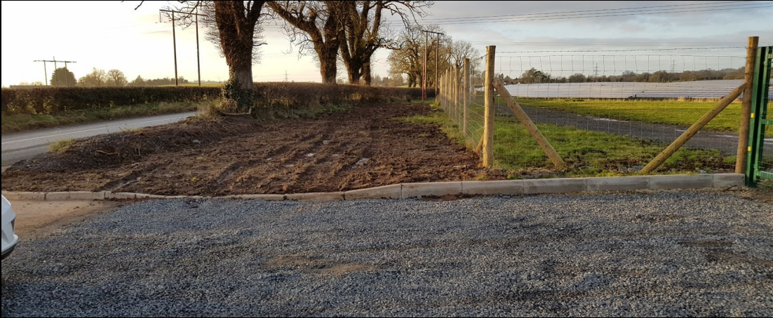
New highway access with associated security deer fencing