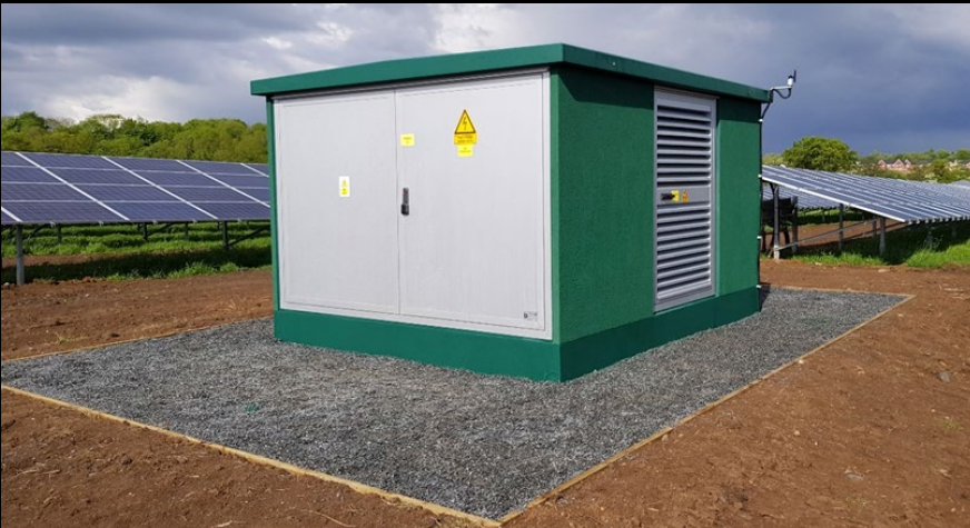
Example of substation